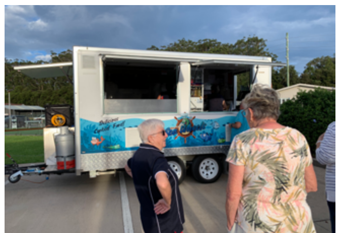
Food trucks at Red Gum (top) and Newport (bottom) have been a welcome convenience to the community.