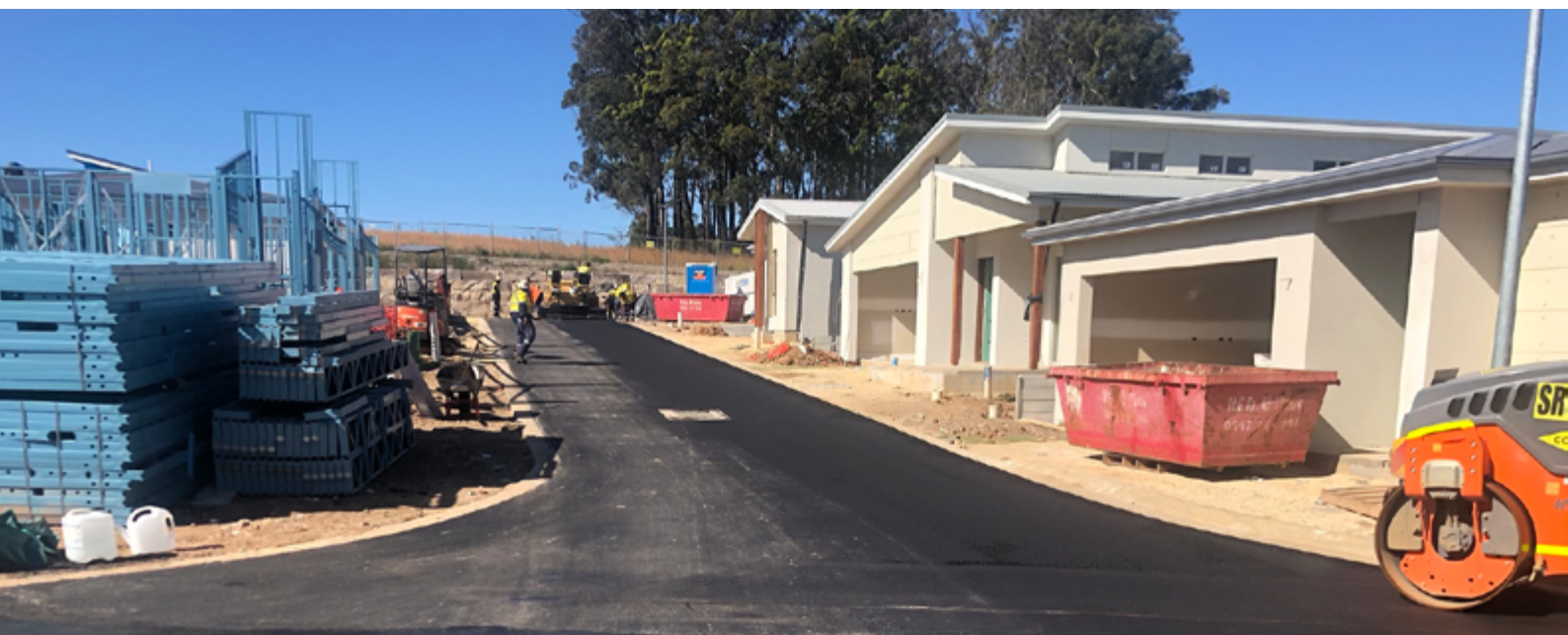
Homes are taking shape in the brand new community.

The homes at Glenfern have been well received by the over 50s looking for an active retirement – or semi-retirement lifestyle. Our deposit holders and other interested buyers are eagerly anticipating the first stage being completed. The construction process at Glenfern has been moving along at a good pace thanks to the favourable weather conditions of late. It's been an exciting time to see the developments taking place at the site each week.