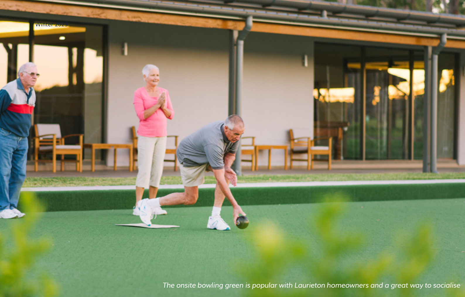
The onsite bowling green is popular with Laurieton homeowners and a great way to socialise