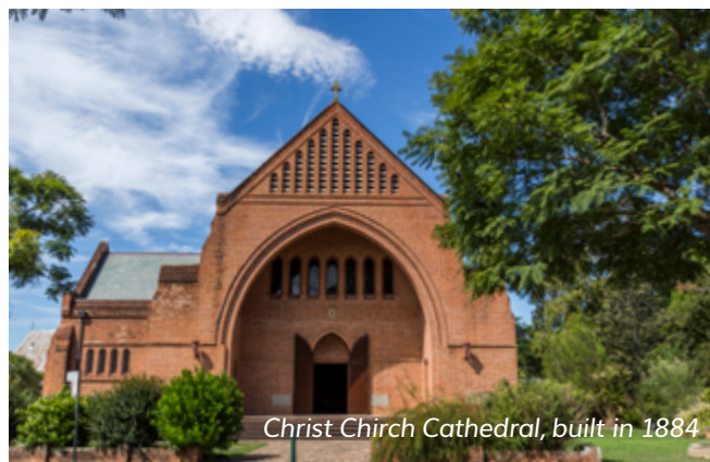
Christ Church Cathedral, built in 1884

The Grafton Regional Gallery is definitely worth visiting and hosts regular exhibitions and a monthly 'Walk and Talk' session for people over 60. Grafton is also a comfortable drive to visit some of the regions beautiful National Parks and stunning beaches.