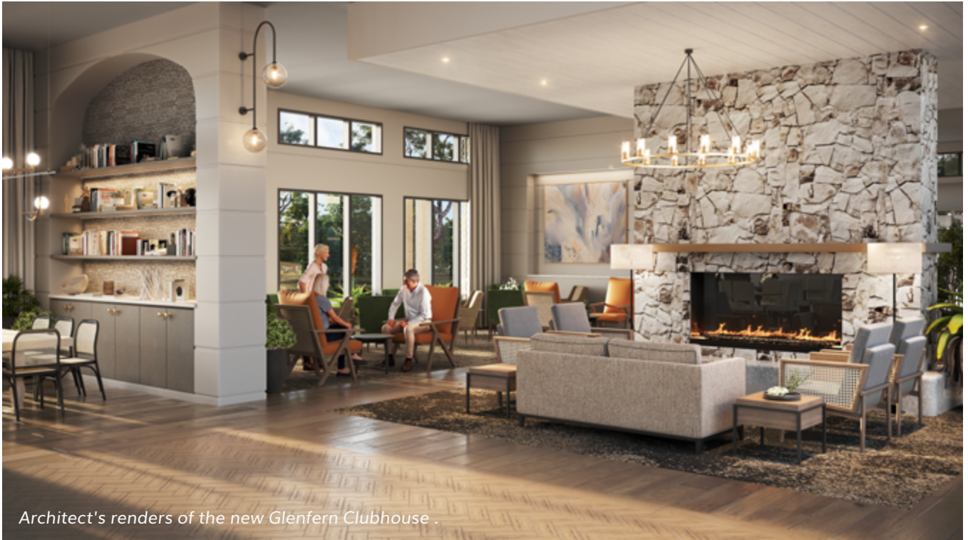
Architect's renders of the new Glenfern Clubhouse .