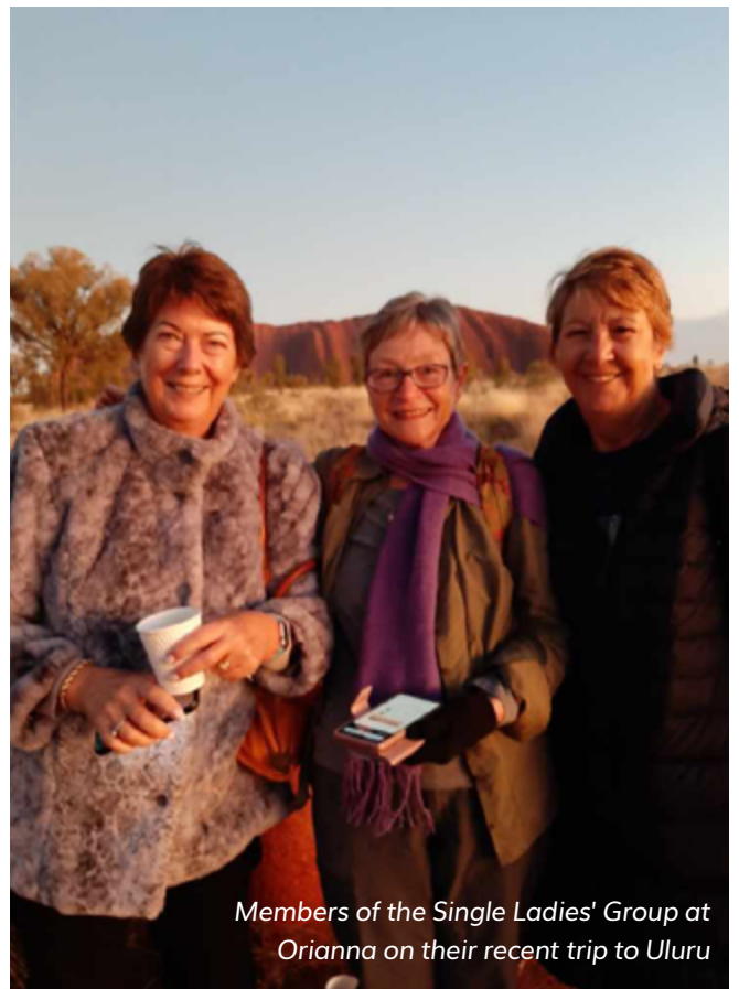
Members of the Single Ladies' Group at Orianna on their recent trip to Uluru