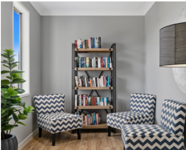
Orianna's amenities are tailored for socialising

In recent years, over 50s lifestyle resorts have become an increasingly popular choice for retirees seeking an enjoyable, serene and secure living environment. While these communities often attract couples, they can also be an excellent choice for singles looking to embrace independence and enjoy a vibrant and fulfilling life.