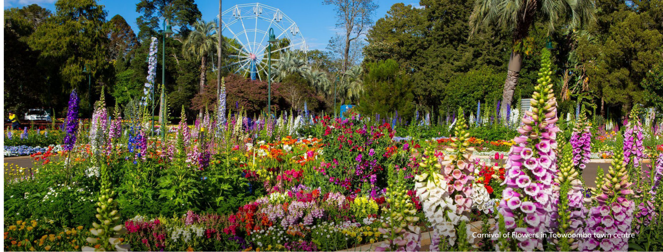
Carnival of Flowers in Toowoomba town centre

Set in the beautiful countryside in Queensland you will find the charming city of Toowoomba. If you're considering downsizing and are looking for the perfect balance of urban convenience and the great outdoors, Toowoomba is definitely a city to consider. Here are three reasons why downsizers are loving Toowoomba.