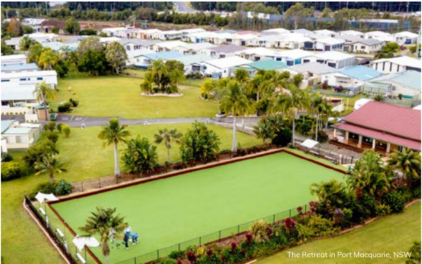
The Retreat in Port Macquarie, NSW