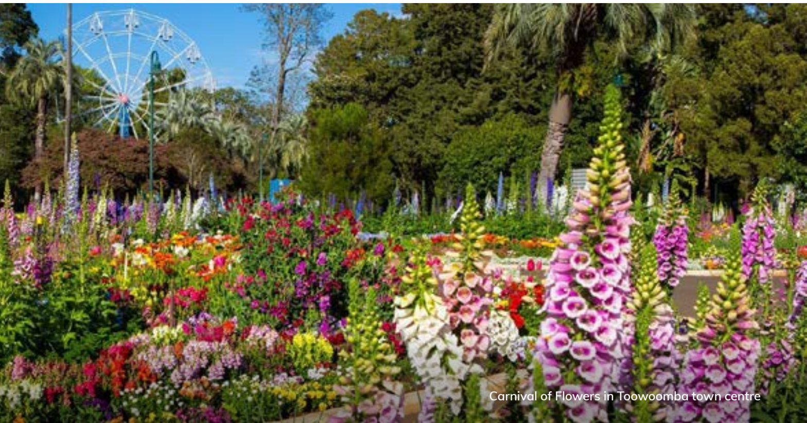
Carnival of Flowers in Toowoomba town centre