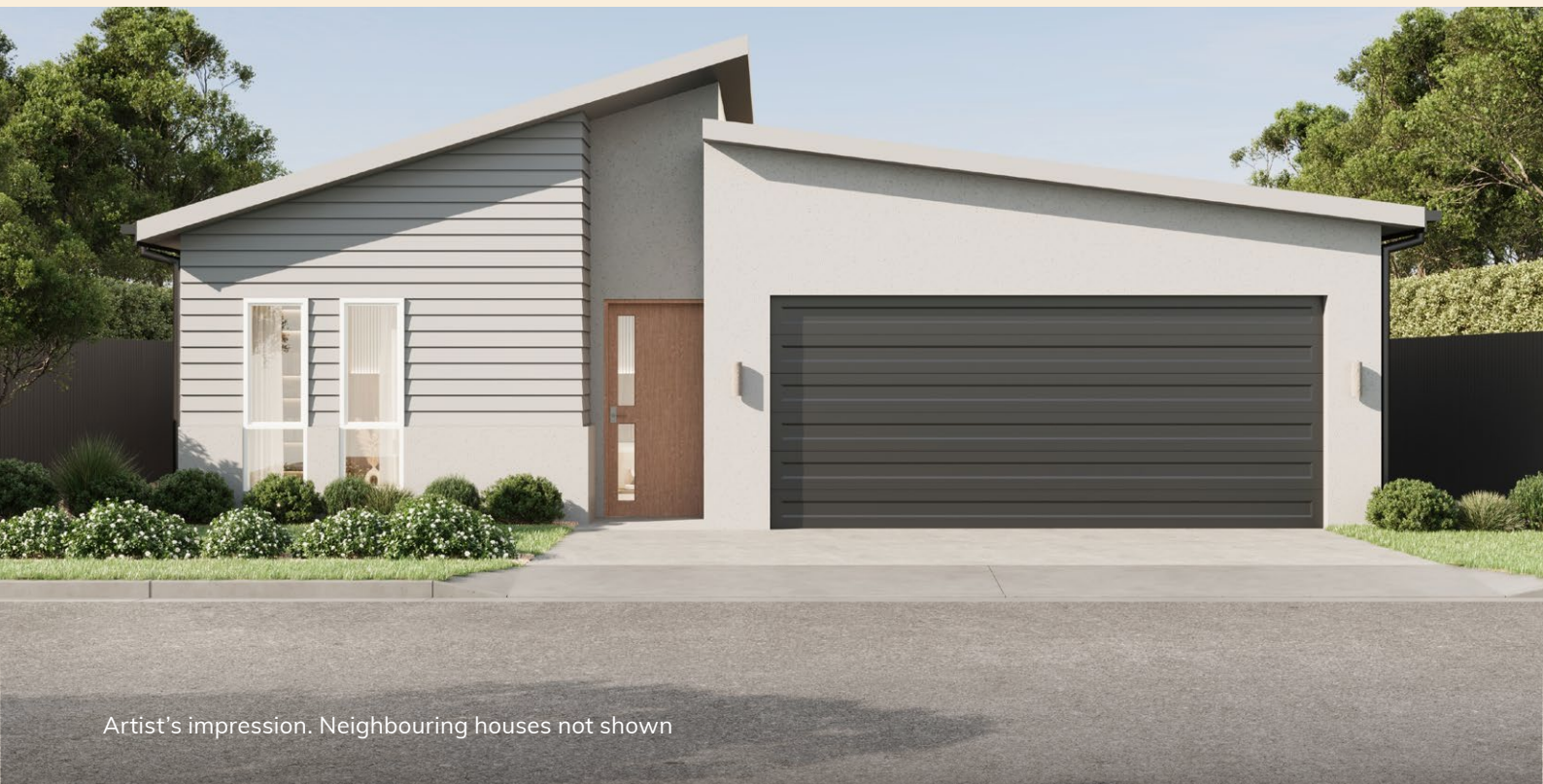
Artist's impression. Neighbouring houses not shown