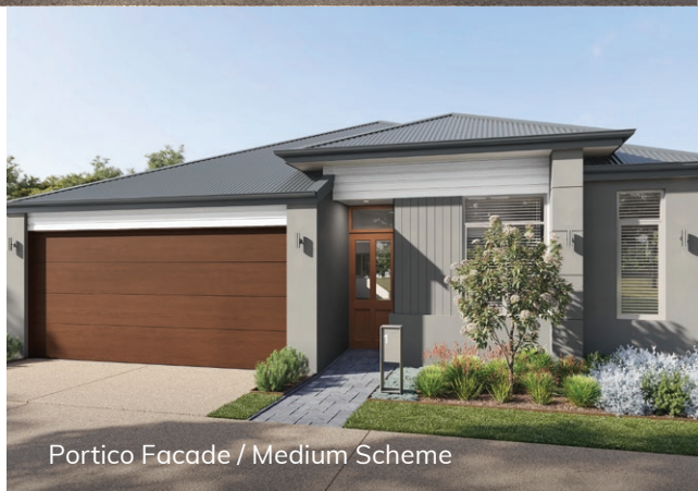
Portico Facade / Medium Scheme