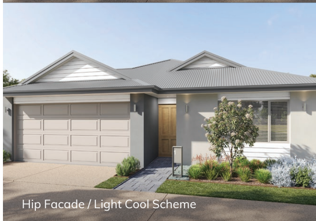
Hip Facade / Light Cool Scheme