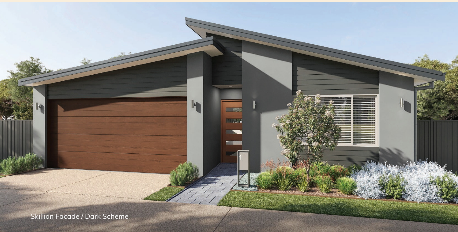
Skillion Facade / Dark Scheme