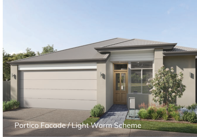
Portico Facade / Light Warm Scheme