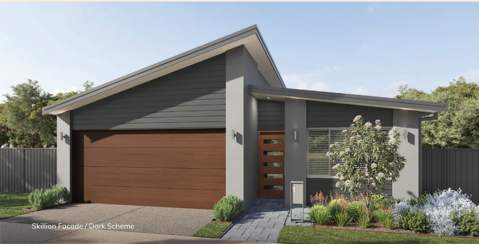
Skillion Facade / Dark Scheme