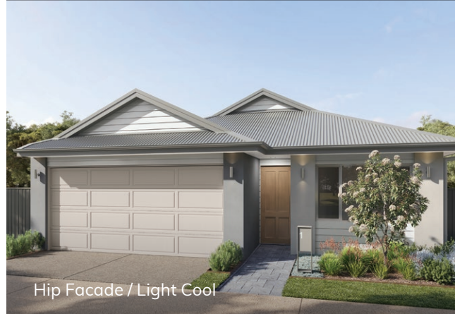
Hip Facade / Light Cool