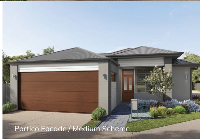
Portico Facade / Medium Scheme