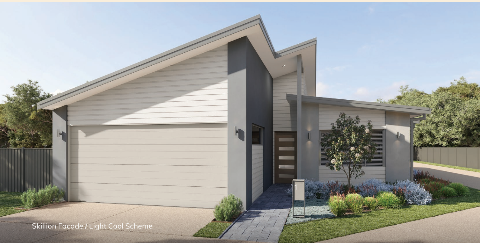
Skillion Facade / Light Cool Scheme