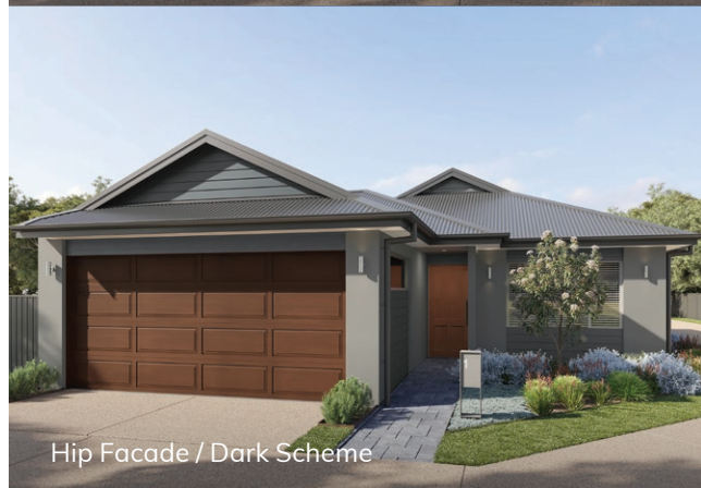
Hip Facade / Dark Scheme